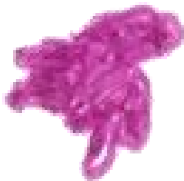
Art By BW