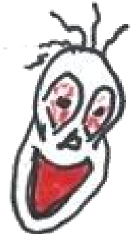
Art By SK