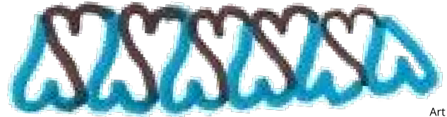
Art by CM